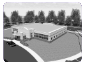
Clark Memorial Hospital Medical Center-Charlestown

The Family Birth Place will see renovations to expand its space in 2005. When completed, the fourth and fifth floors will house eight additional postpartum beds, bringing the total to 15 postpartum beds, 12 beds to serve gynecological and pediatric patients, and 16 newborn beds in the nursery. All 27 beds can be utilized for postpartum services to serve the community's needs.