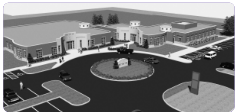
Clark Memorial Hospital Medical Center-Clarksville